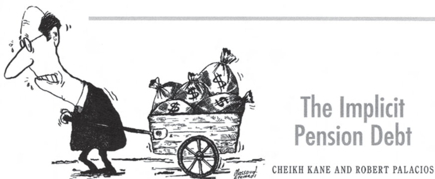
Figure 1: Implicit Public Pension Debt as presented by the draftsman of the magazine Finance and Development, 1996